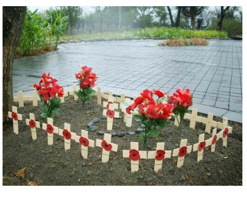
POW Memorial Poppy Garden