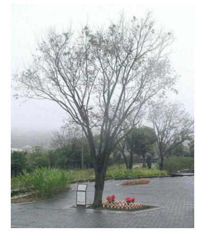
The Taiwan POW Memorial Tree