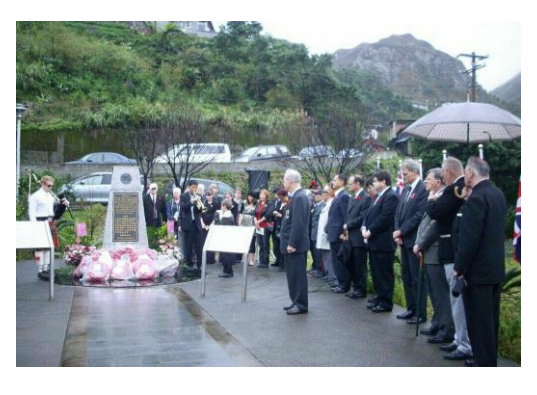
A minute's silence – Lest We Forget!