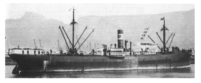
The "hellship" England Maru

More prisoners continued to arrive from Singapore, the Dutch East Indies and Hong Kong throughout 1943 and then more Americans came into the Taiwan camps in 1944. By early 1945 a great many of the 4344 Taiwan POWs had been moved to Japan and Manchuria leaving about 1200 remaining when the war ended in August 1945.