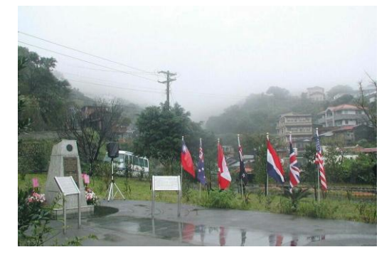
Taiwan POW Memorial with flag tributes

A few more scenes from this year's 11<sup>th</sup> Annual Remembrance Day event – held on the site of the former Kinkaseki Prisoner of War Camp at Chinguashi, Taiwan, Rep. of China