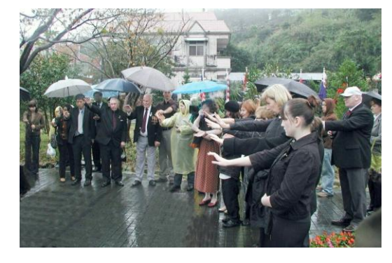
Dedication of the POW Memorial Tree

A few more scenes from this year's 11<sup>th</sup> Annual Remembrance Day event – held on the site of the former Kinkaseki Prisoner of War Camp at Chinguashi, Taiwan, Rep. of China