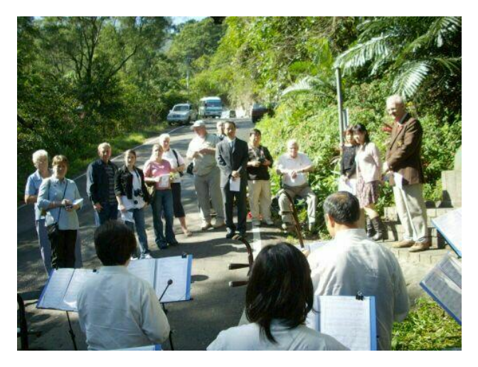
Memorial Service at the former Kukutsu Camp

Saturday evening featured the POW Banquet in honour of the returning POW and the family members. A special ceremony - "The Empty Table" - was held at the outset to commemorate those former POWs who are no longer with